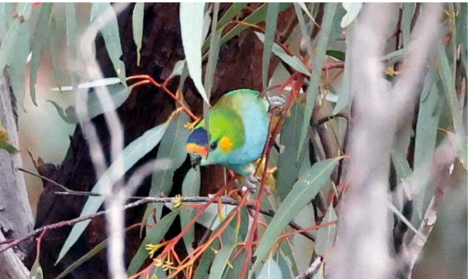
Purple-crowned Lorikeet at Avondale Farm.

During the 2022-2023 financial year WALN continued to collaborate closely with other State and Territory Landcare Organisations, led by the National Landcare Network. We were particularly proud to contribute to the budget submission for the next phase of the National Landcare Program (NLP3) and support the development of the new National Landcare Network Prospectus 'Now Is The Time To Invest In Landcare'.