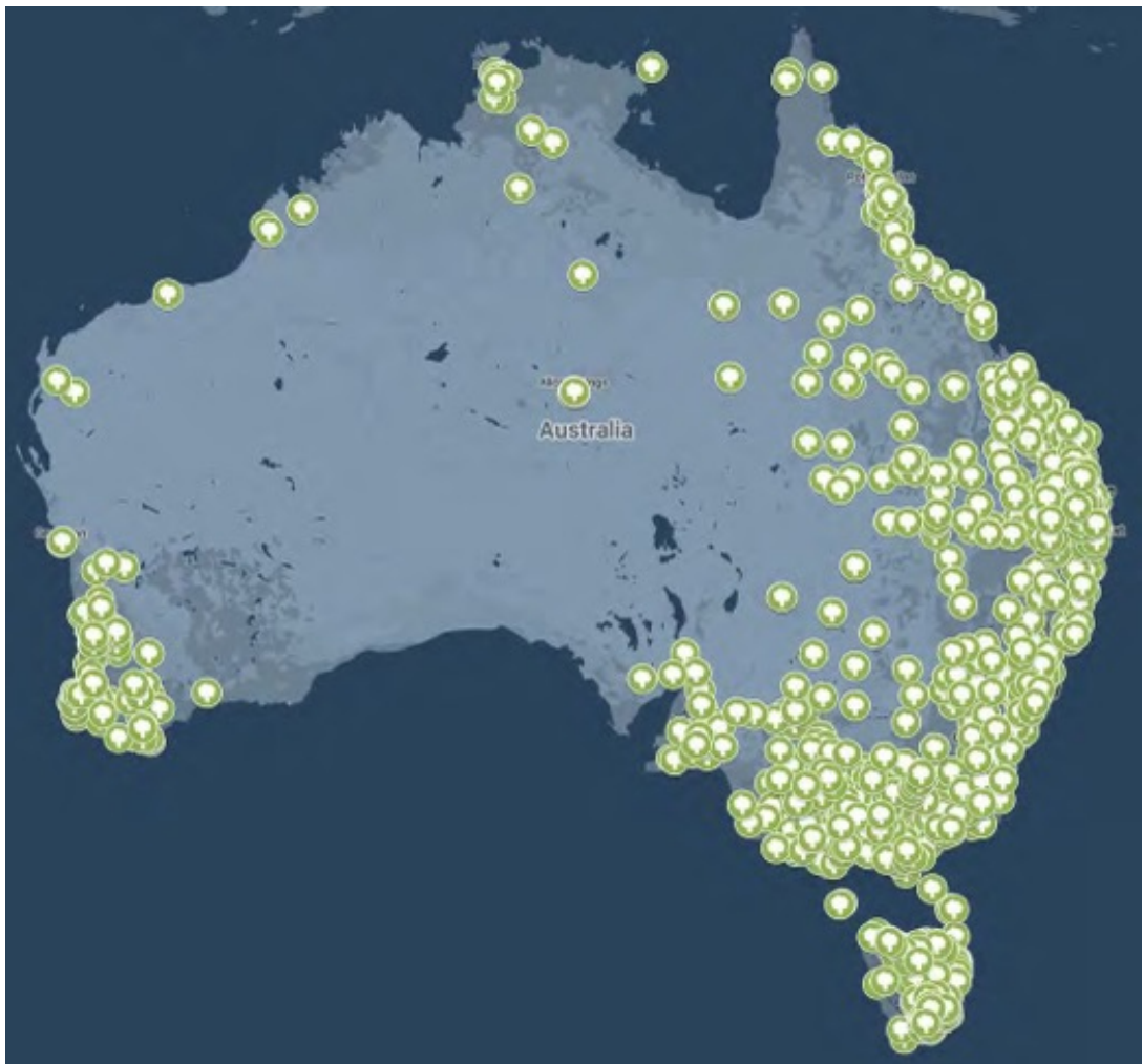
Map of the National Landcare Network showing over 2,000 active STO members based on data provided in August 2022.