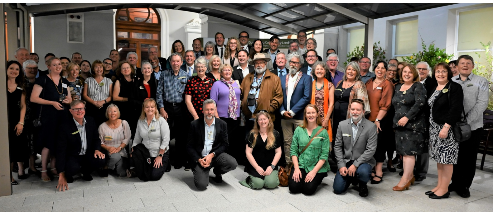
The Launch of the WA Parliamentary Friends of Landcare at WA Parliament House, March 2023