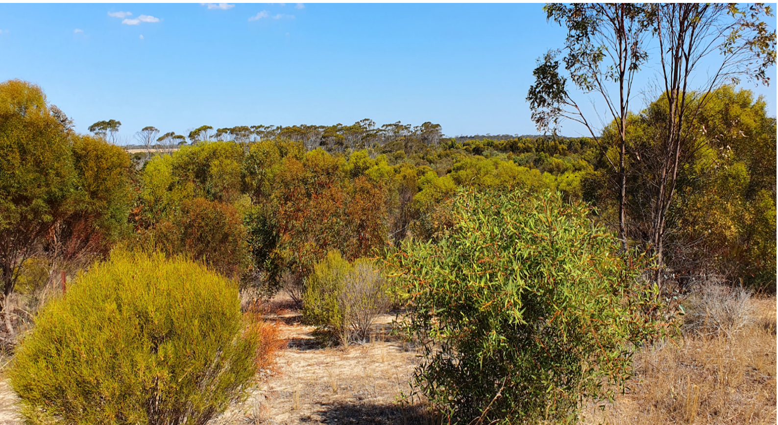
Healthy middle-aged seedlings, Lake Bryde revegetation.

WALN staff contributed to the development of $48m funding bid to the federal government titled Australian Landcare Community Futures Framework.