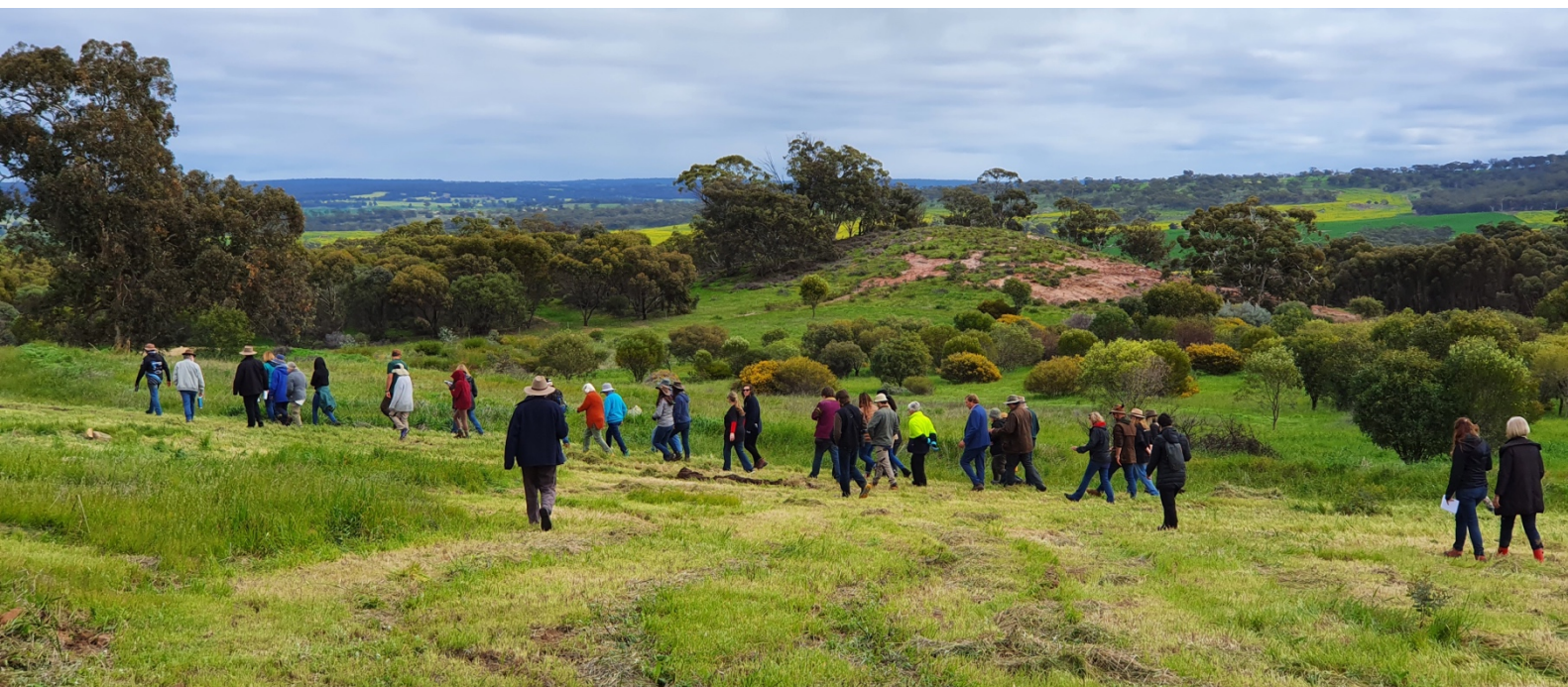
WA Landcare Network Members on Country at the 2022 WALN Annual Gathering, Avondale.