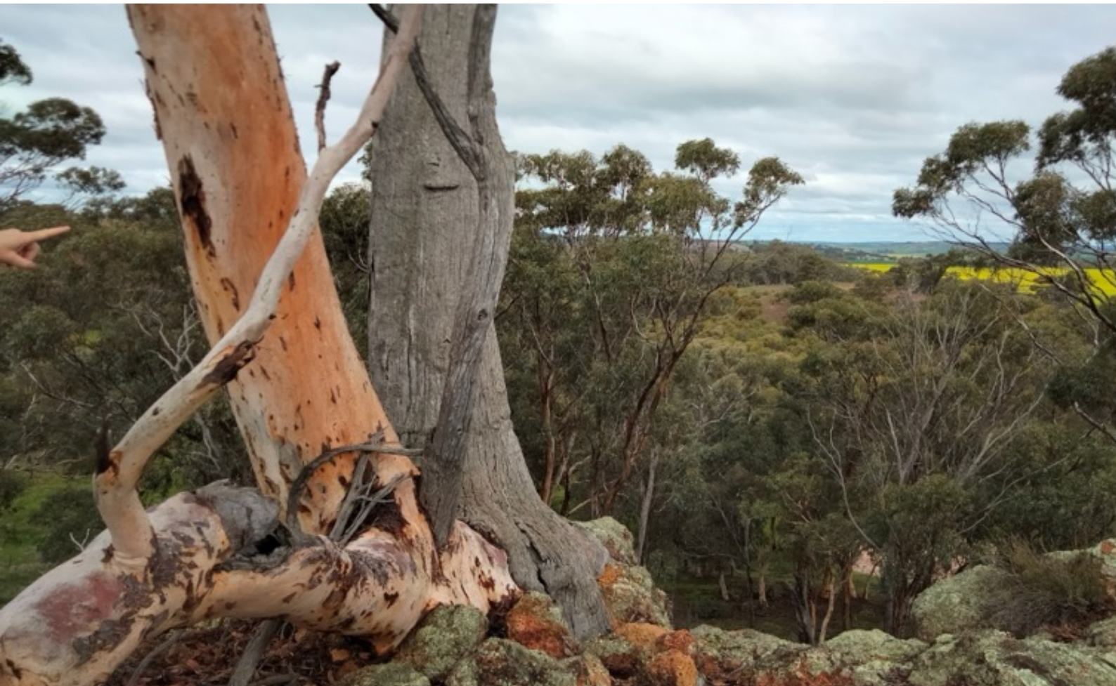
The hilltop view from Avondale enjoyed during the WALN Annual Gathering 2022

To continue to build and grow the landcare network in Western Australia that supports and strengthens the ability of member groups to undertake their work and have strong state, national public and private support, and involvement.